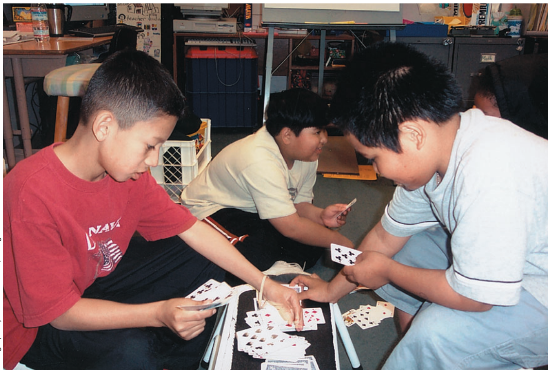
Children run through a practice game before entering into competition.